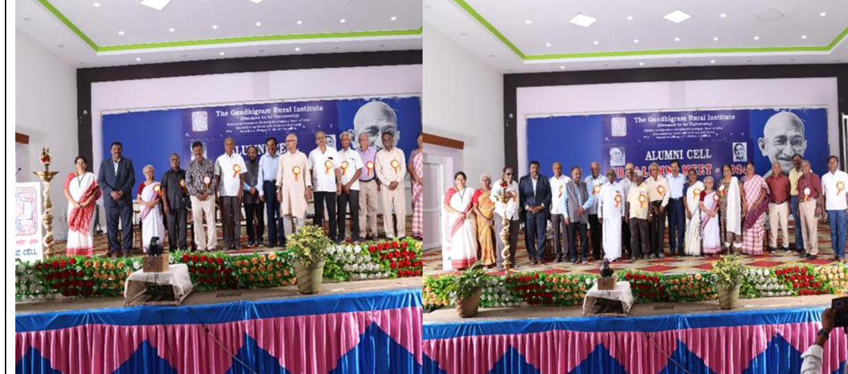
Standing Ovation to the Senior Alumni(Above 65 years) of GRI