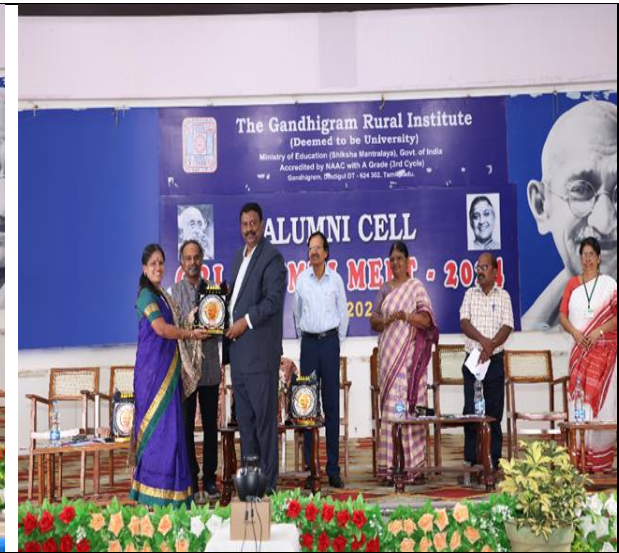
Honouring Alumni Star donors