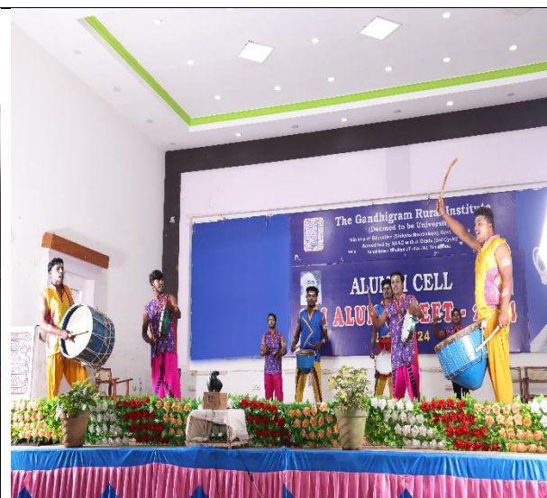
Cultural Events by GRI Students(Cultural Cell)