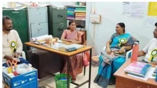
Discussion: Alumni's contribution to the welfare of the institution

After the general session, the alumni were cordially welcomed to the SEFL with open arms. All the alumni members were honoured with a customized welcome card as a symbol of gratitude. The eagerly anticipated event of "the joining departmental session" happened in the Department of English and Communicative Studies, School of English and Foreign Languages at 2.00 pm.