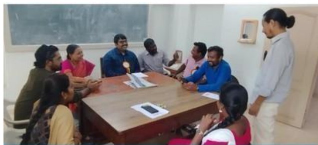
ALUMNI MEET 2024: the ultimate moments of joy and nostalgia in SEFL

The Alumni of SEFL have donated to the institution in miscellaneous non-financial forms. The alumnae have guided the current batch of I MA ECS and II MA ECS students concerning job opportunities open in different fields. To pave the way for juniors, alumni have gathered details of the students for employee referrals in case of any vacancy available in their organization. As a benefaction, they communicated the ensuing details: professional setting, working culture, high-paying career opportunities, and the real-world applications of their education. They guaranteed the students that they would have constant communication with the students and mentor them through the myriad challenges they undergo during their occupational journey.