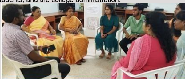
Topic of Discussion: The Demand for Multidisciplinary Approach in Literary Research

The Alumni Meet 2024 was organized on 6th September, 2024, at Multipurpose Auditorium and Alumni Award Function was conducted on 2nd October, 2024, at Silver Jubilee Hall by the Alumni Cell of The Gandhigram Rural Institute (Deemed to be University), Dindigul. The alumni meet aspired to: acknowledge the achievements made by the former students, track their present position as a concern even after graduation, spark their nostalgic memories, and provide a platform for interaction between alumni, faculty, students, and the college administration.