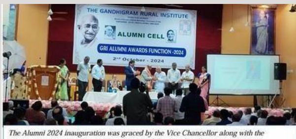
The Alumni 2024 inauguration was graced by the Vice Chancellor along with the