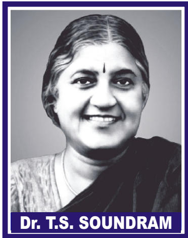
CHANCELLOR (18.08.1905 - 21.10.1984)