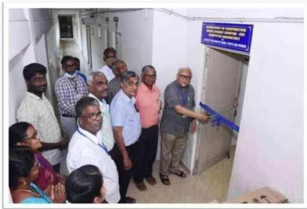
Inauguration of UBA Capacity Building Training Centres for Rural Youth and Women in collaboration with Department of Cooperation by Prof. Rajesh Tandon, UGC Expert Group Member, New Delhi on 27.04.22