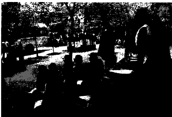
Students in the Village Placement program at GRI, Dindigul.

Amrita University has introduced rural field-based learning in several courses where science and engineering students make field projects on rural tourism, energy, housing and sanitation ( www.amrita.edu.in ).