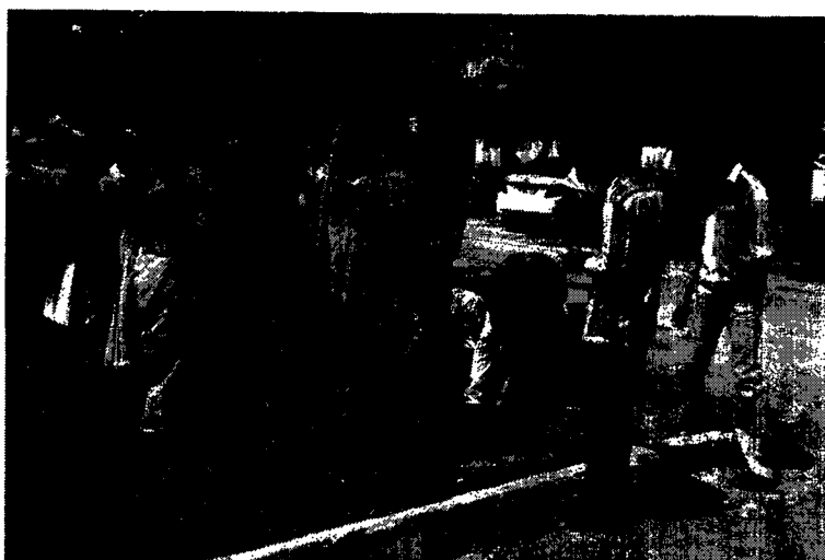
Students at Gandhigram Rural Institute practising 'Shramdaan'

http://www.ruraluniv.ac.in/BestPractices?content=Shramdhan