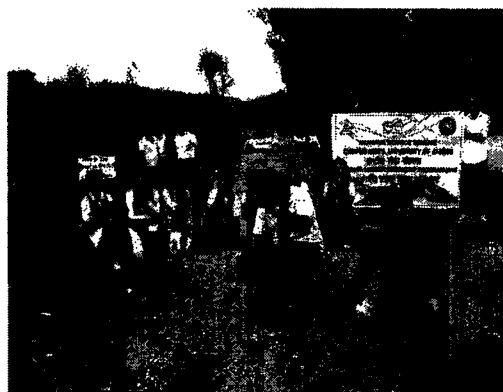
Awareness through Nukkad Natak by NSS volunteers in village Khara Madana

http://www.ruraluniv.ac.in/BestPractices?content=Shramdhan